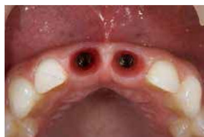
Proper Tissue Management