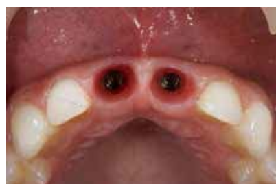
Proper Tissue Management