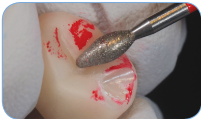
Adjustment of occlusion using football-shaped red-band Dialite finishing diamond (8369DF) (Recommended Speed: 100K rpm)