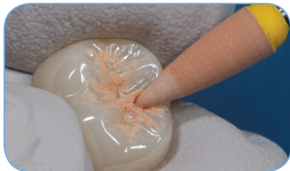
Dialite ZR orange fine polishing point (H2FZR) for high shine.