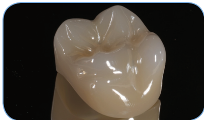
Zirconia crown polished with Dialite ZR.