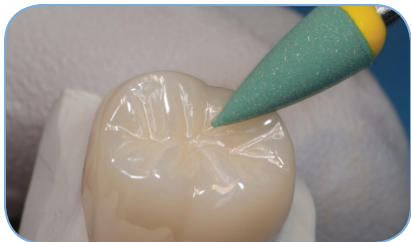
Dialite ZR green medium polishing point (H2MZR) for pre-polishing.