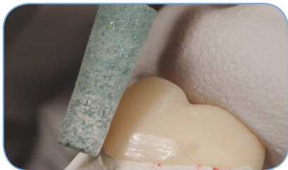
Adjusting and contouring with green coarse LD Grinder (LD13C).